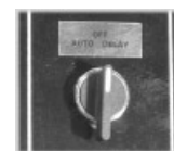
FTD001 Delay timer