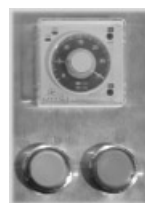
AS001 Programmable Pulse Steam