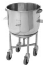
BTF040D BTF060D (Bowl sold separately)